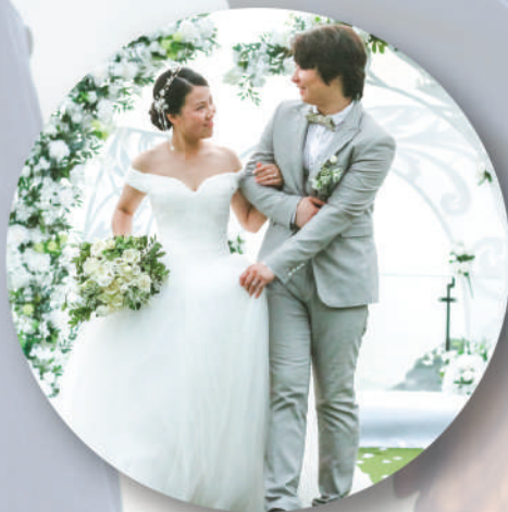
Steaming of wedding dress and/or suite for the Bride or Groom (one piece per person)