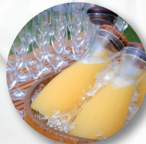
A traditional Phuket pineapple welcome drink served during the ceremony for up to 20 guests