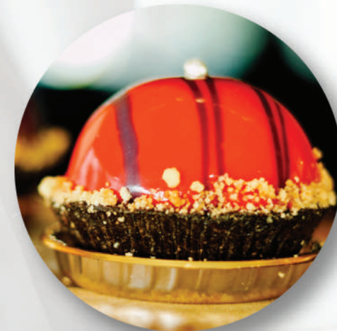
A small wedding cake presented at the end of the ceremony to the wedding couple