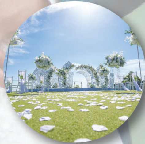
A floral walkway in amongst the guests