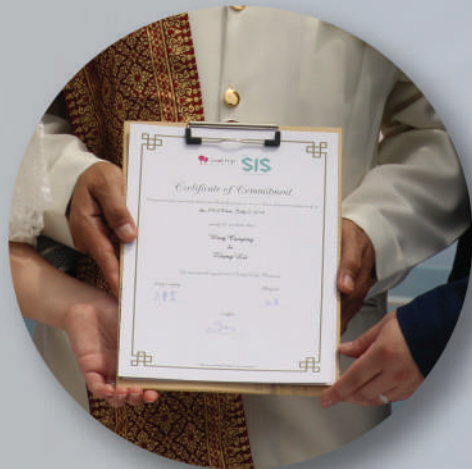
A commemorative certificate signed during the ceremony (Non - Legal)