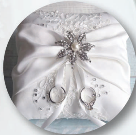
A Ring Pillow