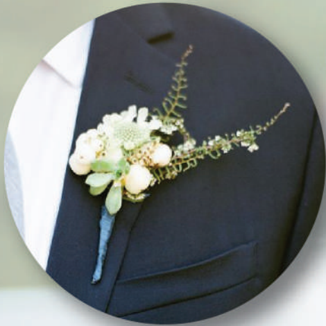
Hand styled boutonniere for the groom