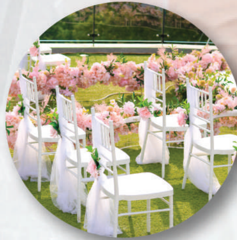
Up to 20 chairs guests of the Bride and Groom