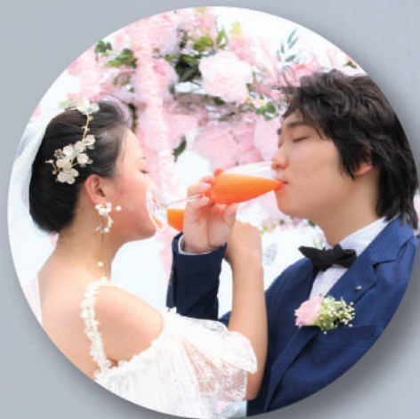
A Thai traditional non - alcoholic wedding toast for the Bride and Groom