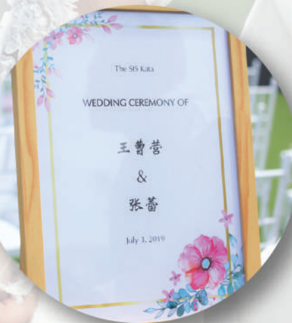
A personalized "Welcome" sign announcing the names of the wedding couple and date of the ceremony