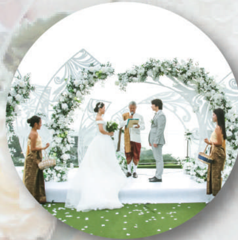
■ 2 flower girls in traditional Thai costume ■ 2 page boys in traditional Thai costume