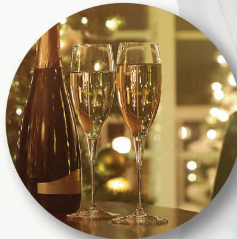
A bottle of Prosecco to toast the wedding couple