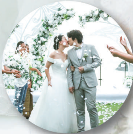
A Flower shower after the Bride and Groom ceremony