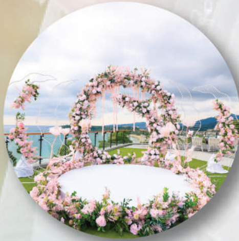
A stylish floral decoration arrangement in the ceremonial location