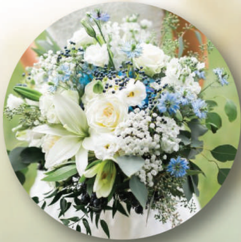
An elegantly styled hand - held bouquet for the bride